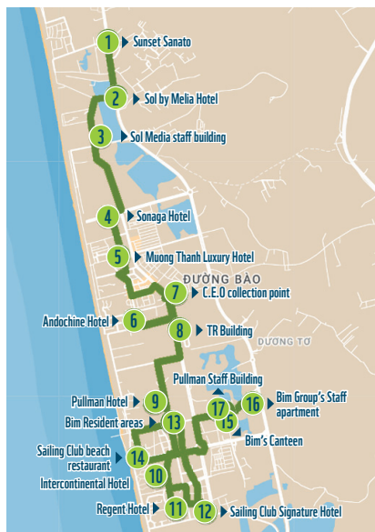
Map of Duong Dong Route

Any commercial accounts located along these two waste collection routes